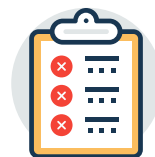
Impossible to react in real-time

The ecosystem, by nature, is heterogeneous with multiple functional teams involved in delivering the product. These teams choose the tools which enable them to innovate and be most productive. Across a product delivery ecosystem, typically enterprises use Project and Portfolio Management tools, Requirement Management tools, Agile Planning tools, Project Tracking tools, DevOps tools, ITSM tools, etc. There is no single vendor in the marketplace that provides a platform to meet the needs of these functional teams. Hence, the only alternative for the enterprises is to select best of breed tools which let their teams perform in the most efficient and effective manner. However, it presents a different set of challenges: