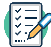
Manual and cumbersome reporting